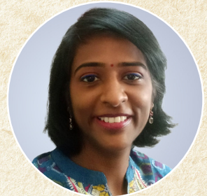
Dr Vidhya Government Theni medical College